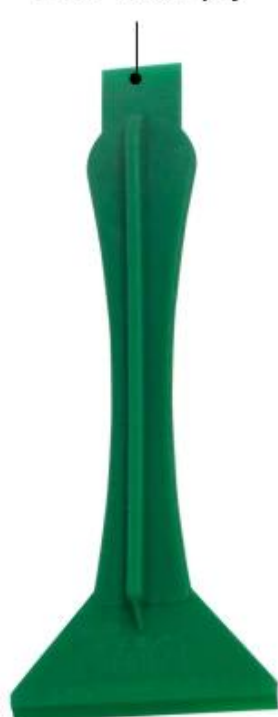
128 Plastic pry