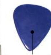
Open the shell paddles