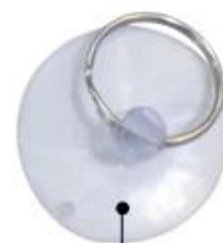
Strong suction cup (Samll)