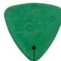
Open the shell paddles