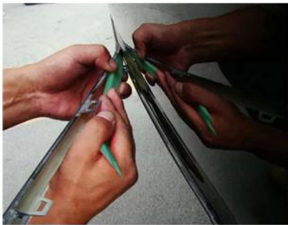
"S" Pry plate