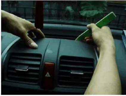
Medium pry plate