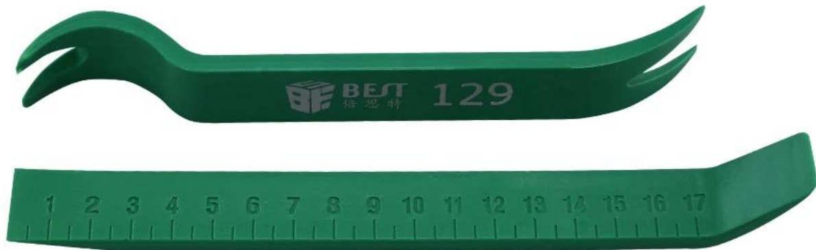
Medium pry plate