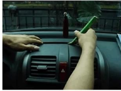
Medium pry plate