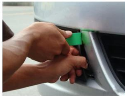
"S" Pry plate