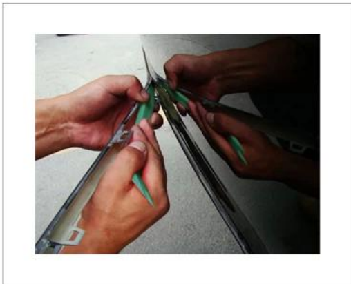
"S" Pry plate