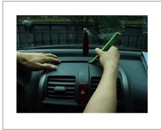
Medium pry plate