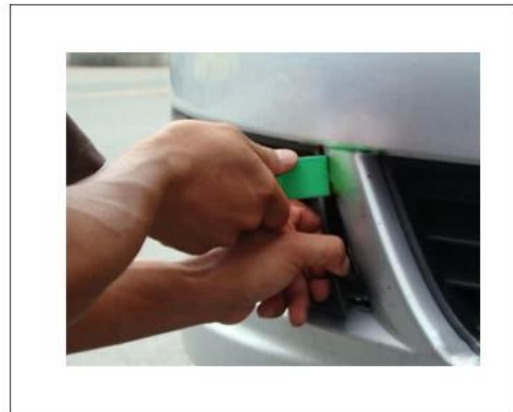
"S" Pry plate