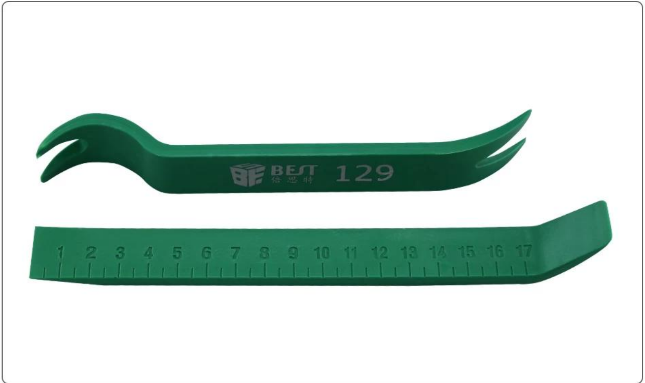
Medium pry plate