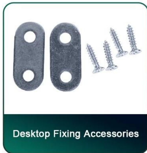
Desktop Fixing Accessories