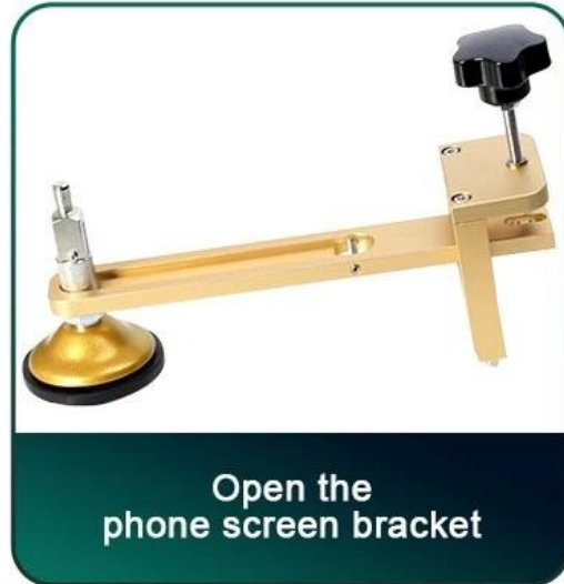
Open the phone screen bracket