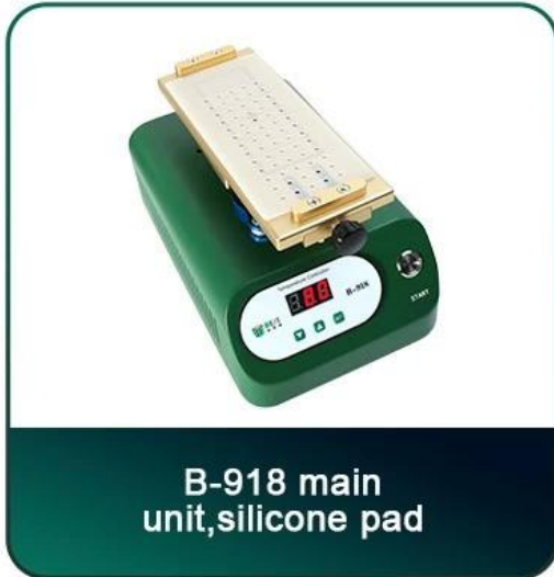
B-918 main unit, silicone pad