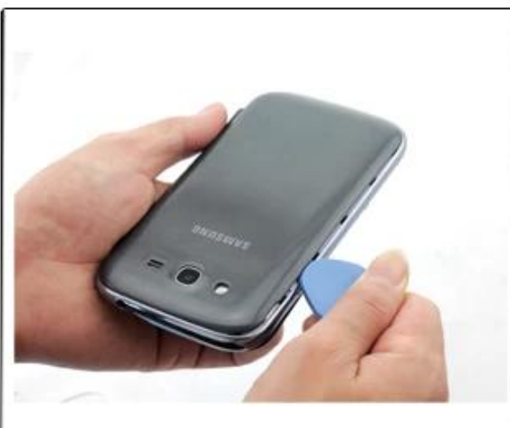
Paddles, stripped from the screen and the external screen below the double-sided tape to open the phone shell