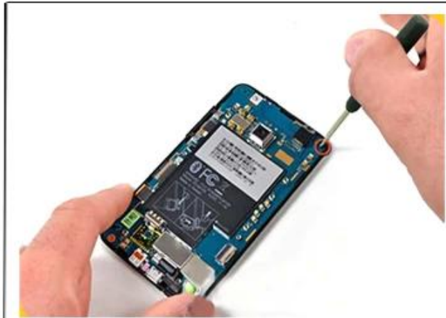
Screwdriver: demolition internal screw