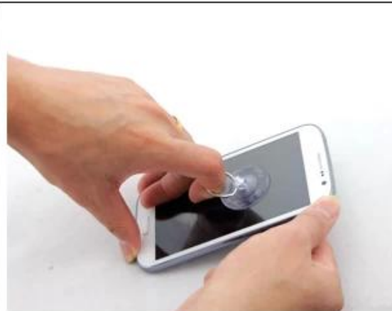
Chuck: outside the suction screen