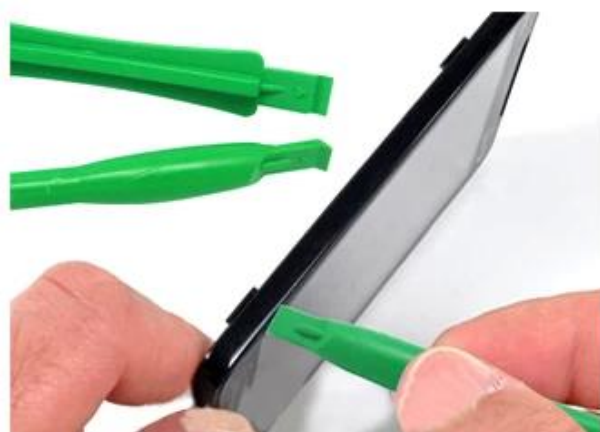
Crowbar: cable from deck