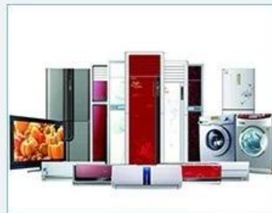
Home appliance maintenance