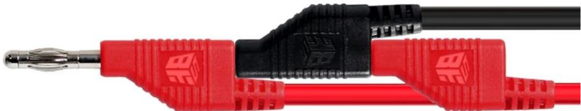
Plug stacking diagram