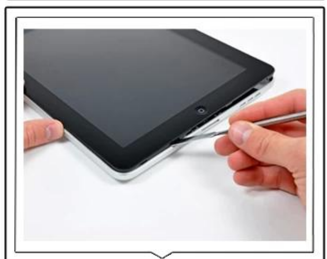
IPAD maintenance experts are essential tools to disassemble