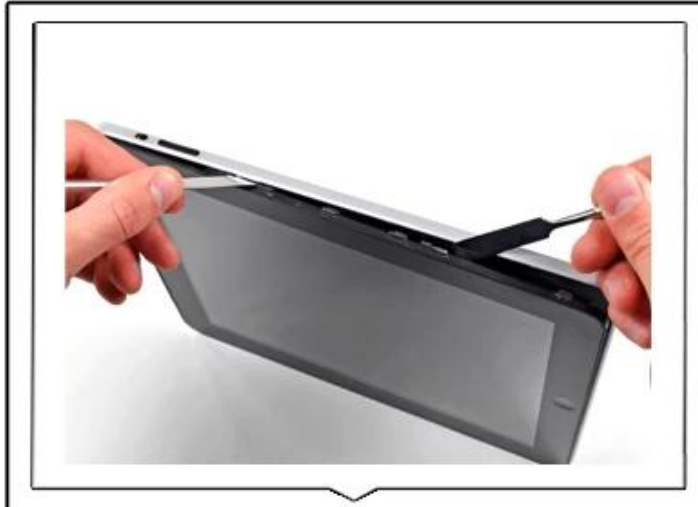
Never hurt housing