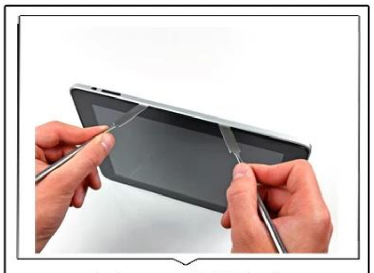
Edges smooth, flat, hard