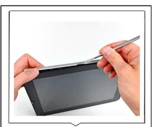
Thinnest at only 0.2mm, but not sharp