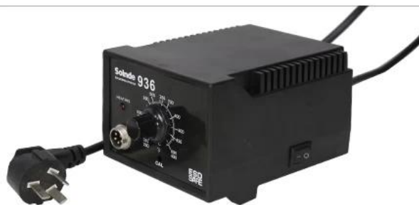
BST-936 main unit