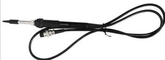
Soldering iron handle