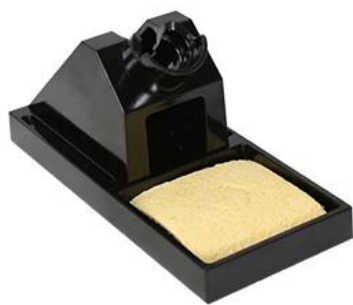
Soldering iron stand