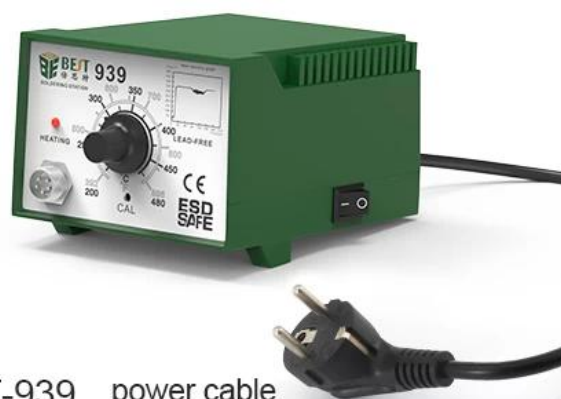
BST-939 power cable