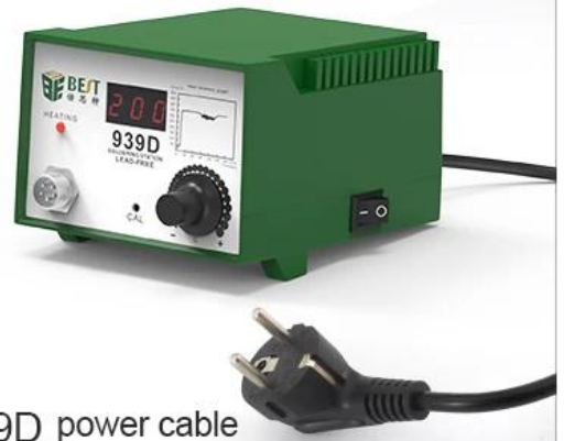
BST-939D power cable