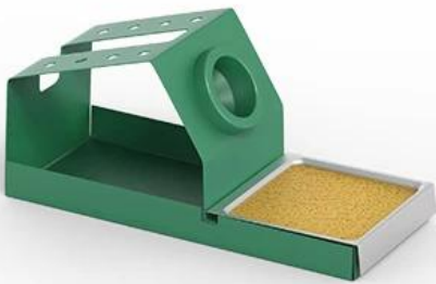
Soldering Iron frame