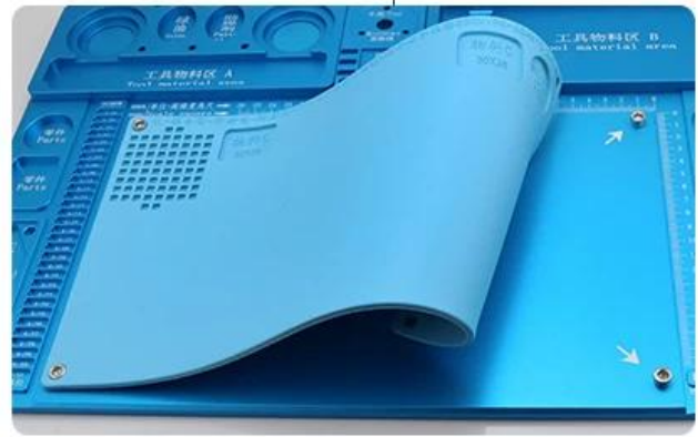
High temperature resistant silica gel pad