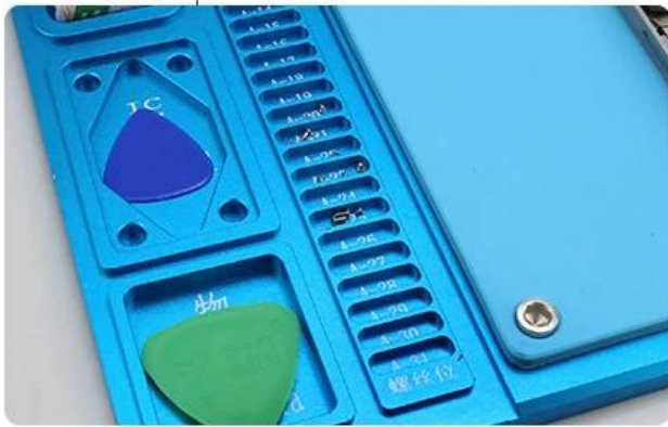
A variety of screws to prevent loss Material: aluminum alloy