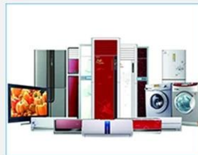
Household Electric Appliances