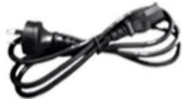
Power cord * 1