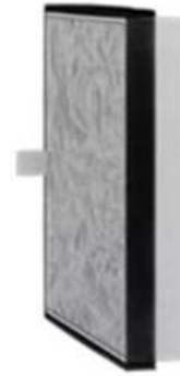
Composite filter cotton*1