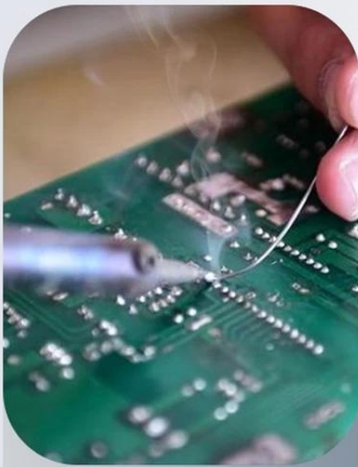
SOLDER DUST PURIFIER

Effectively address exhaust gases in different homework situations Various solutions for smoke, dust, and odor