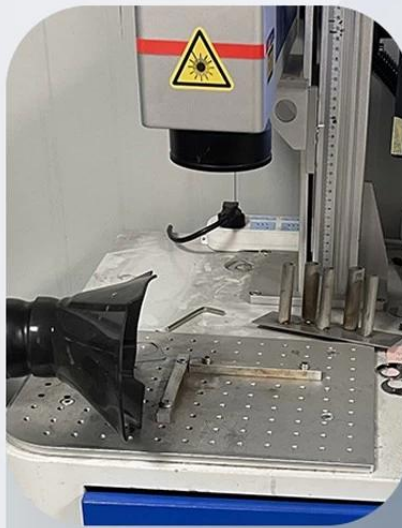
SOLDER DUST PURIFIER