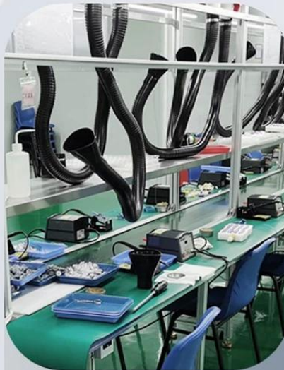
ONE TO MULTIPLE WORKSTATIONS