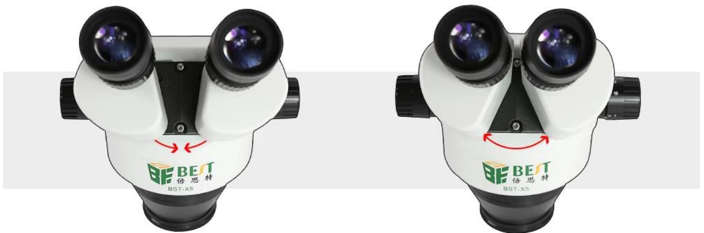
Adjustable binocular tube