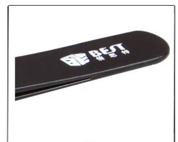
Using high-precision equipment screen printing, legible