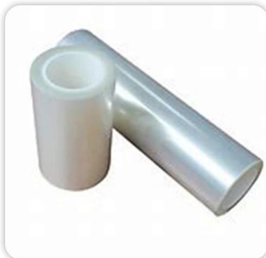
UV GLUE CURING