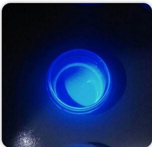
FLUORESCENT AGENT DETECTION