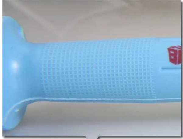
Carved stripes ,Anti-slip designed