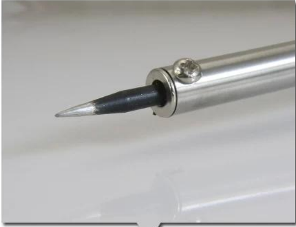
Alloy tip, fast heat transfer, not easy to ablate and easy to replace