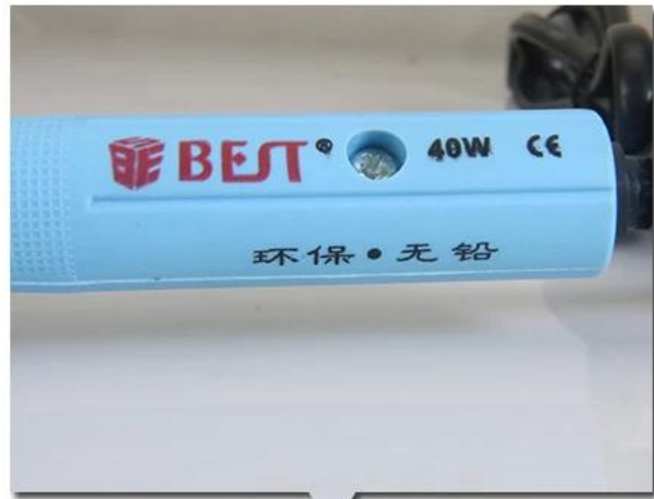
Environmental protection plastic