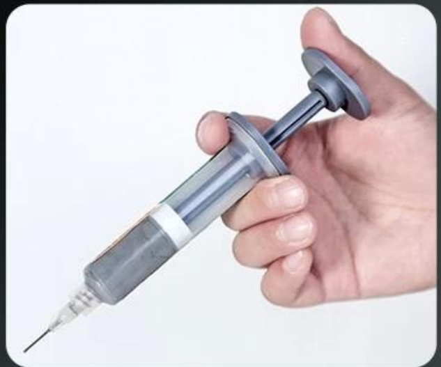
4. Install the booster rod, push it to use

Note: The white rubber stopper in the syringe cannot be removed.