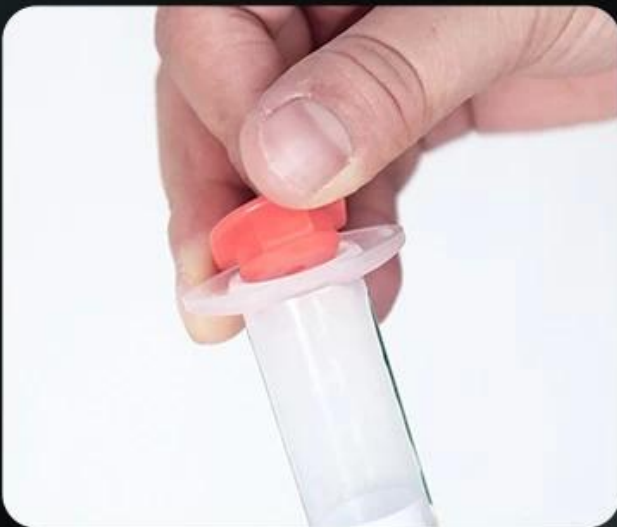
3. Open the end cap of the syringe barrel

Note: The white rubber stopper in the syringe cannot be removed.