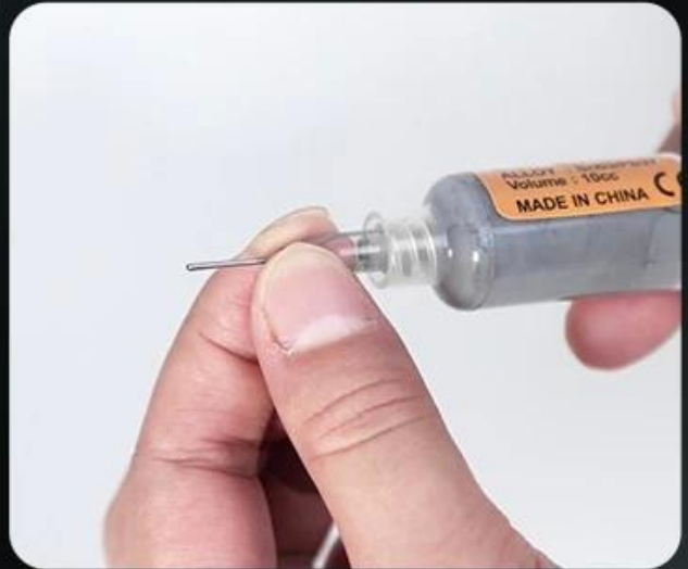
2. Install the appropriate needle