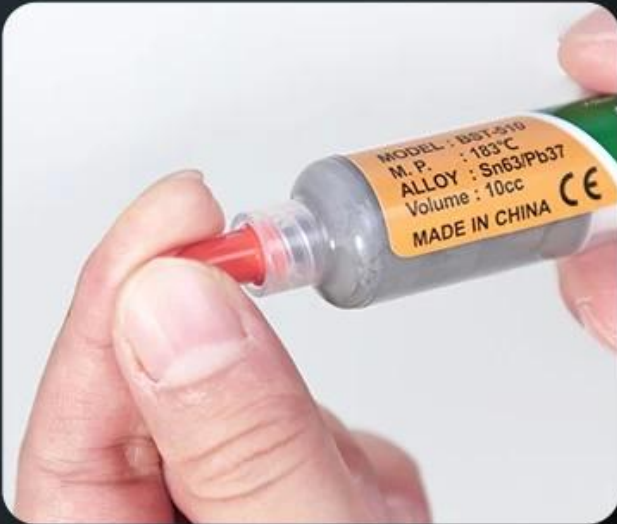
1. Open the lid by turning it counterclockwise