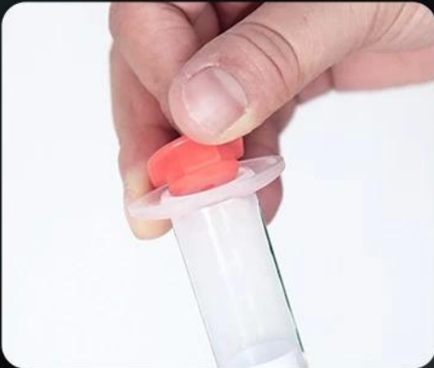
3. Open the end cap of the syringe barrel

Note: The white rubber stopper in the syringe cannot be removed.