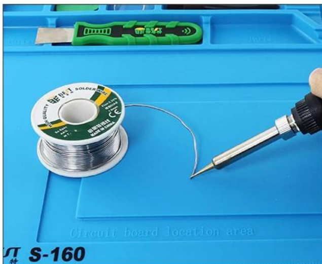
High temperature resistance