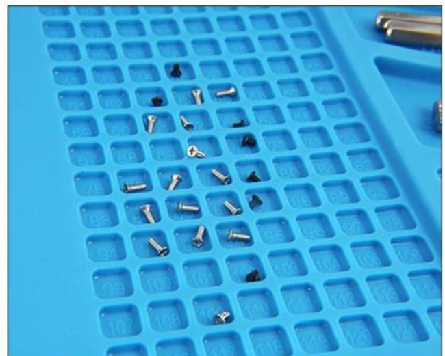
A variety of screws to prevent loss