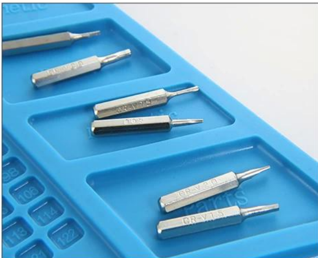
Independent magnetic Division