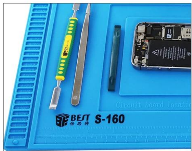
Antistatic, large working area