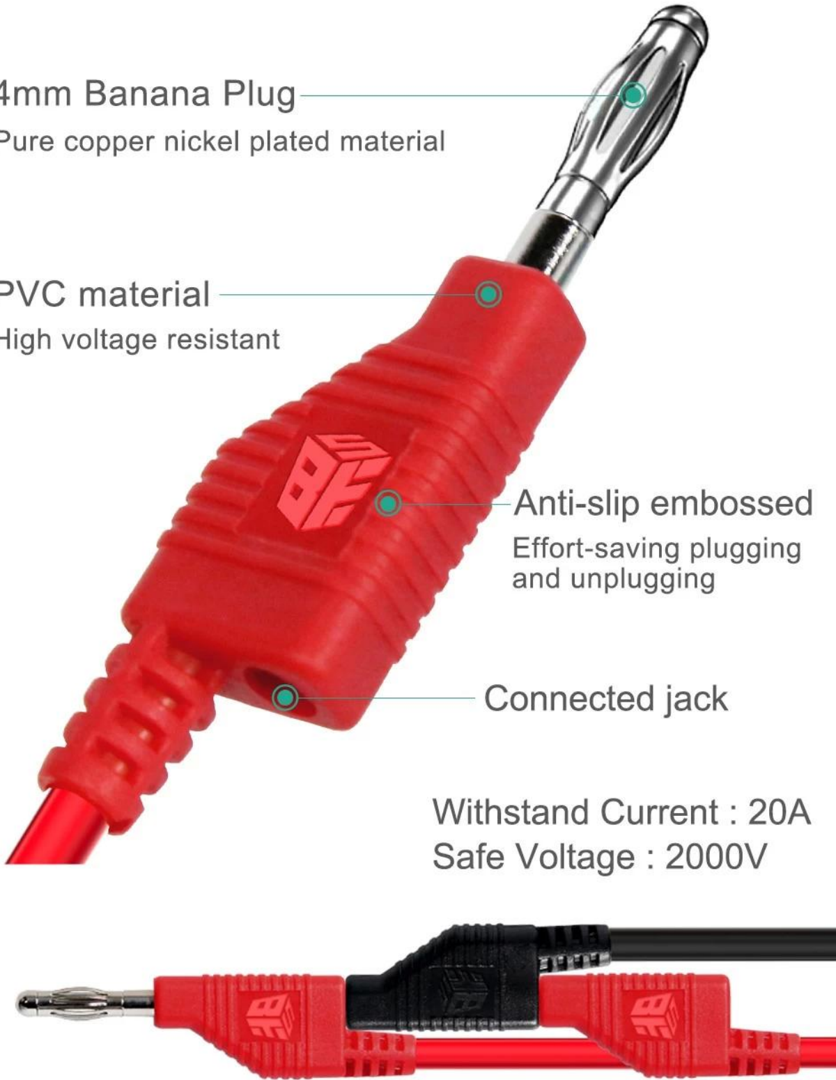
Plug stacking diagram

Withstand Current : 20A Safe Voltage : 2000V