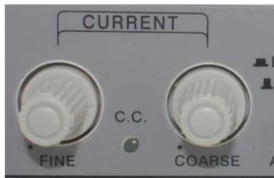
Current FINE / COARSE adjustment knob Steady flow indicator