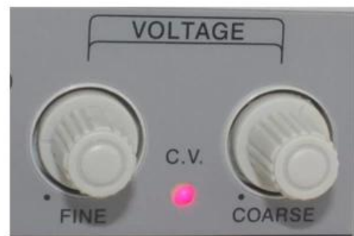
Voltage FINE / COARSE adjustment knob Regulators indicator