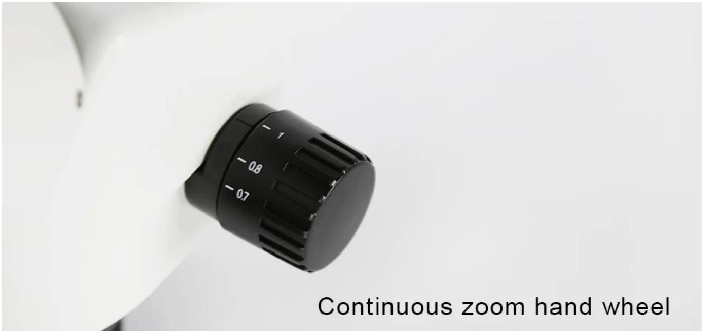
Continuous zoom hand wheel