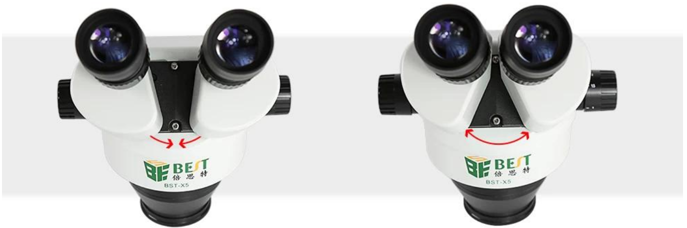
Adjustable binocular tube