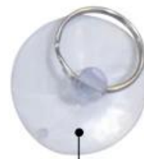
Strong suction cup (Samll)