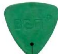
Open the shell paddles