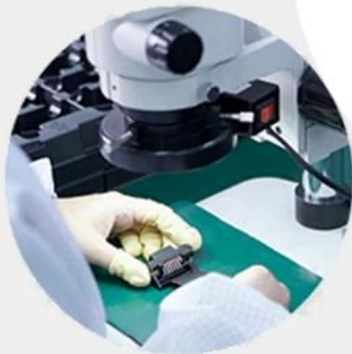
Industrial assembly ▲