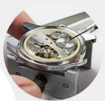
Watch repair ▲