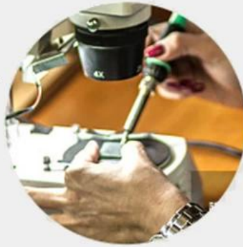
Electronic circuit repair