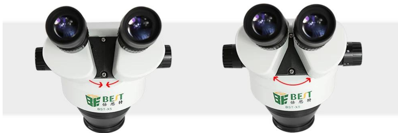
Adjustable binocular tube