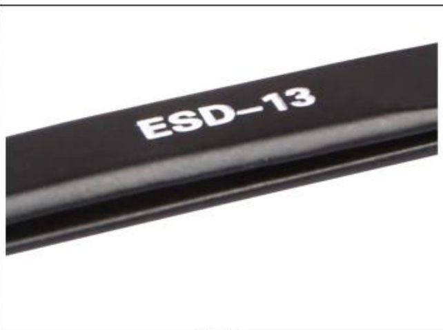
Stainless steel tweezers, Tail polished, no scratches, flawless surface