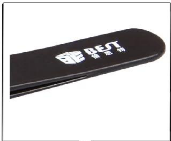
Using high-precision equipment screen printing, legible