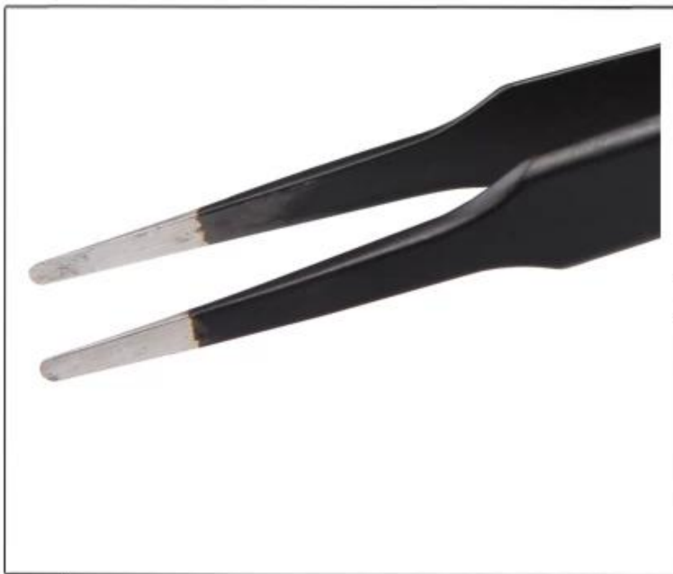
When two tip are folded, smooth seamless