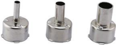
Wind gun nozzle 5, 8, 10mm