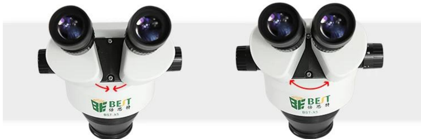
Adjustable binocular tube