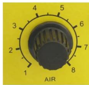
Air volume regulator