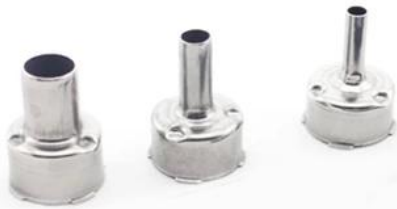
Stainless steel nozzle 10mm,8mm,5mm, three different size