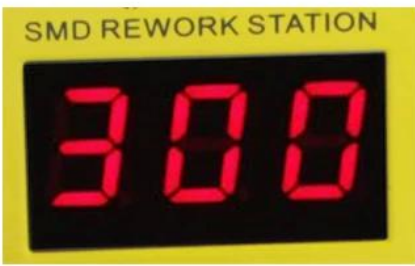
Temperature display of heat gun