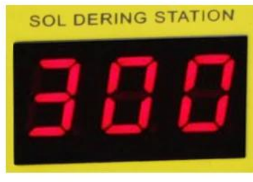
Temperature display of solder iron