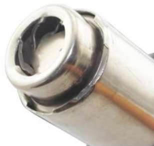
Air outlet Screw diameter, the better the protection element