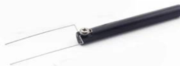
IC extraction tool