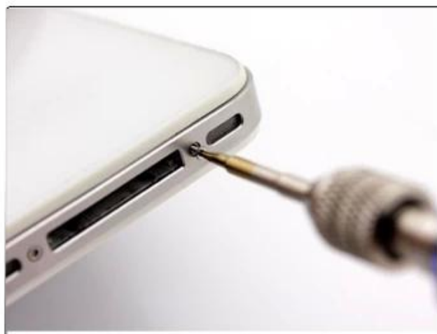
★ 0.8 Detachable iphone4, iphone4S iphone5 the bottom of the screw