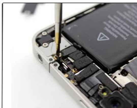
Word 2.0 Detachable iphone4, iphone4S iphone5 internal screw