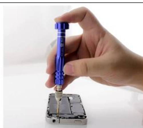
Aluminum handle, feel comfortable; moderation convenient, non-slip design