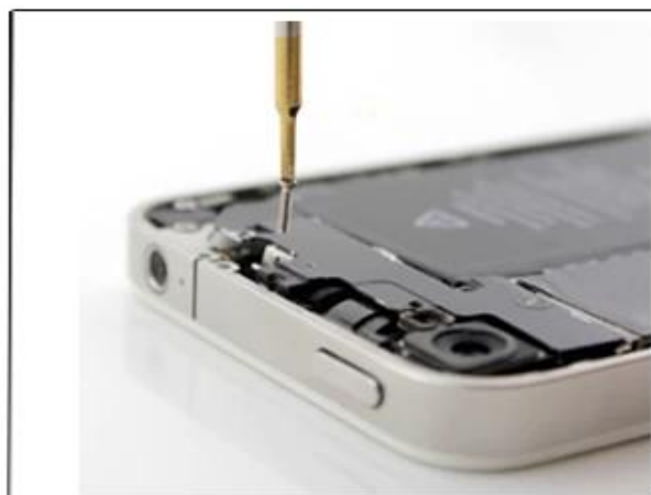
PH000 removable iphone4, iphone4S iphone5 internal screw