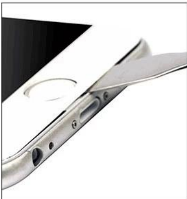
Suitable for disassembling mobile phone, tablet computer and other electric.