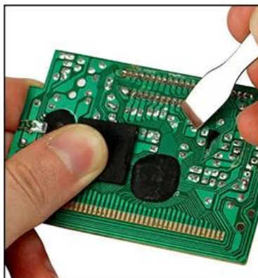
Higher hardness for scraping.