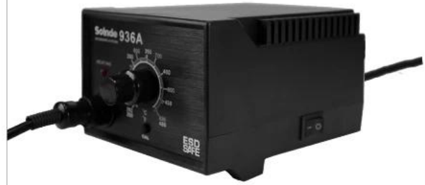
BST-936 main unit