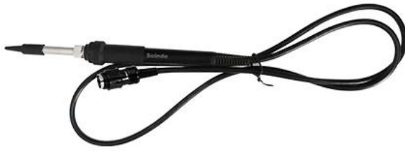
Soldering iron handle