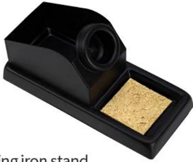
Soldering iron stand