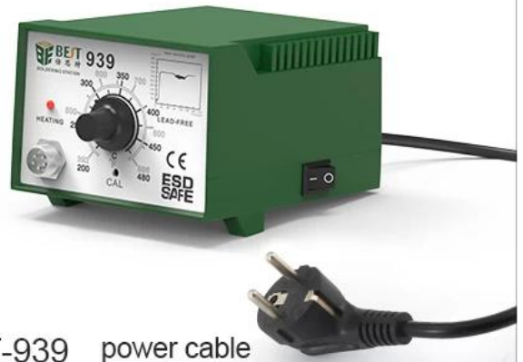
BST-939 power cable