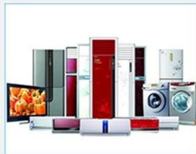
Household Electric Appliances