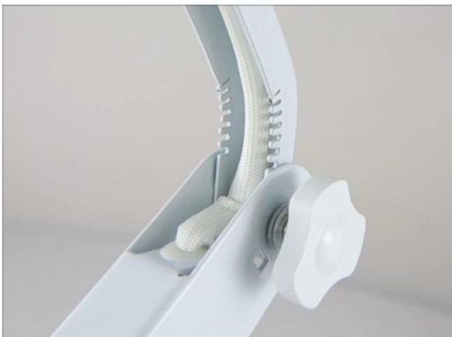
Metal support, solid and stable structure