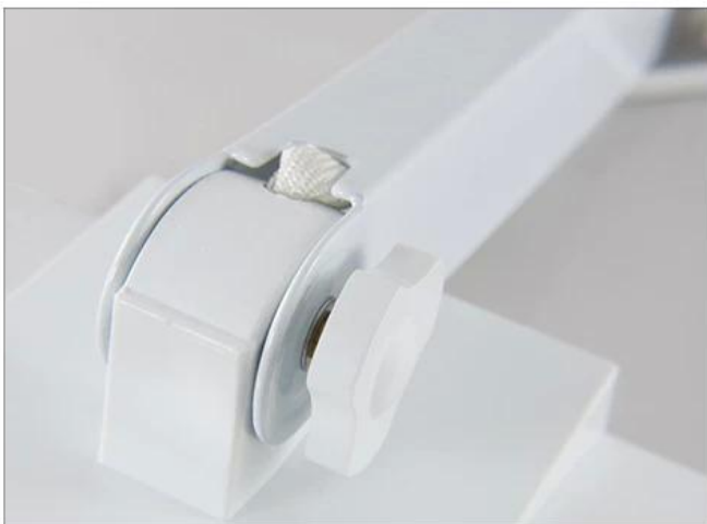
Light cover regulator