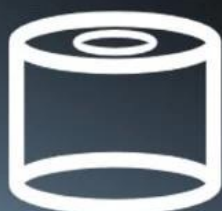
Aluminum Alloy Toolholder