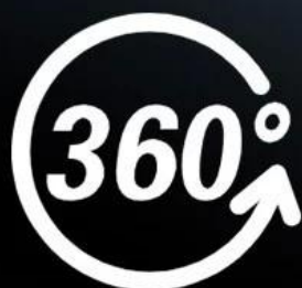
360° screw cap