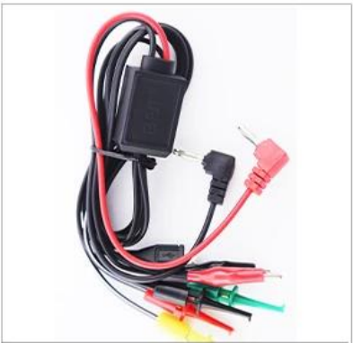
Power test line