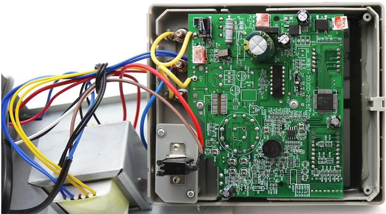
▲ PCB integrated motherboard double-sided chip technology