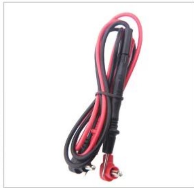
Test lead test line