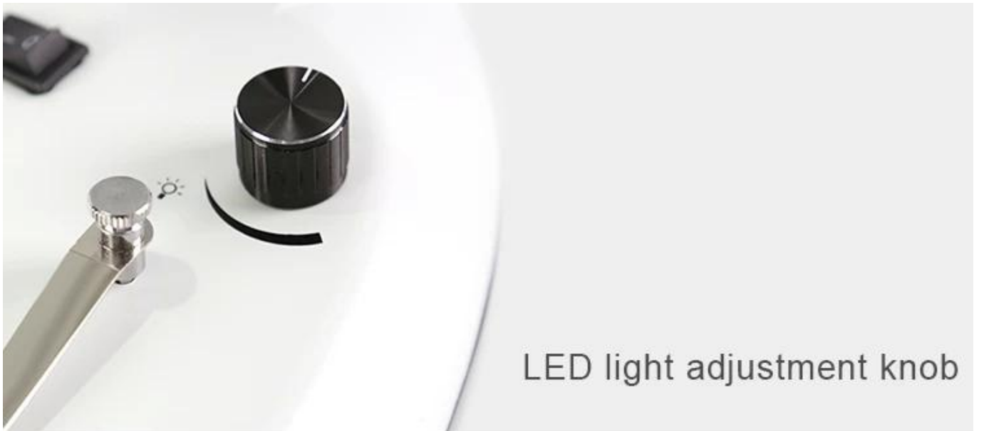
LED light adjustment knob