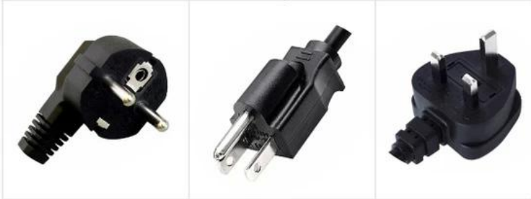
European regulations 220V-50Hz