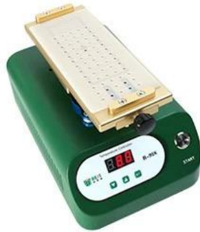
B-918 main unit,silicone pad