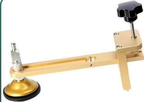
Open the phone screen bracket