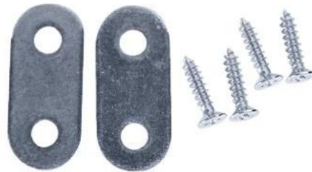
Desktop Fixing Accessories