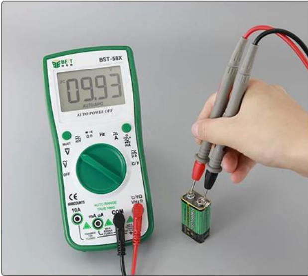
DC voltage measurement