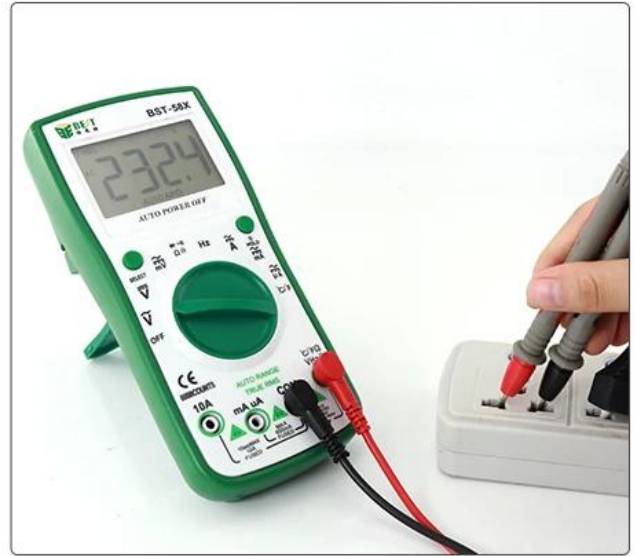
AC voltage test