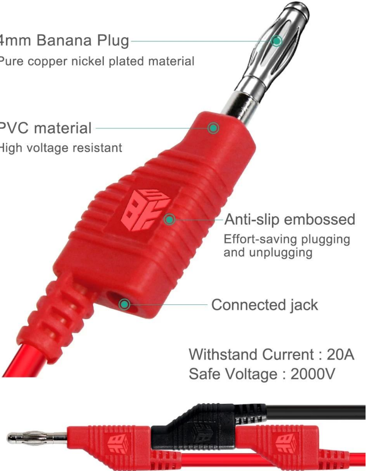
Plug stacking diagram

Withstand Current : 20A Safe Voltage : 2000V