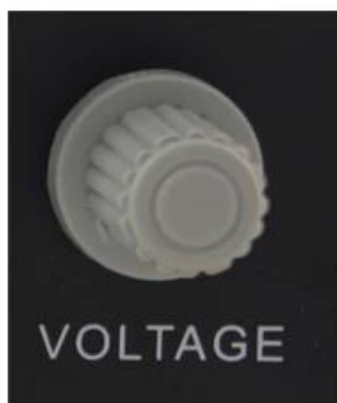
Voltage output / input mode conversion

After power on, press the switch is turned on to work, close to stop working