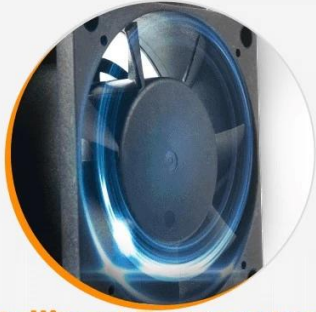
Intelligent Temperature Control: low noise, turn on when \geq 50^{\circ}\text{C}