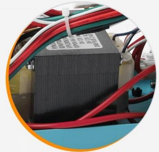
Single Phase Transformer: low ripple