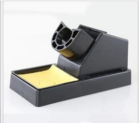
Iron handle frame