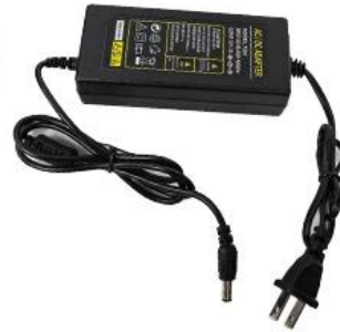
1 power supply