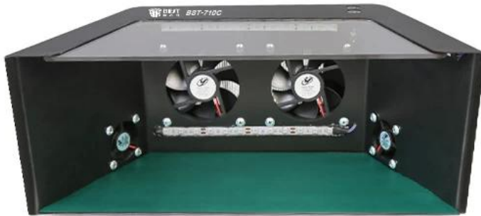
1 dust removal workbench