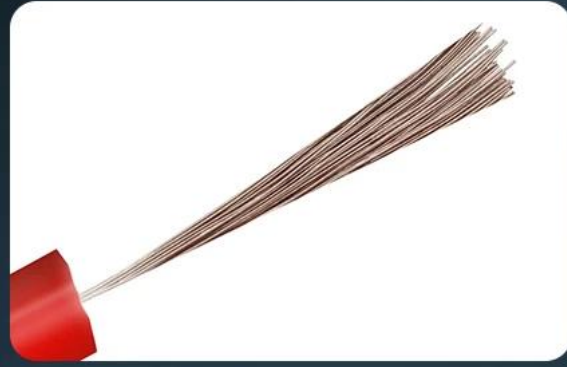
Poor quality clip wire