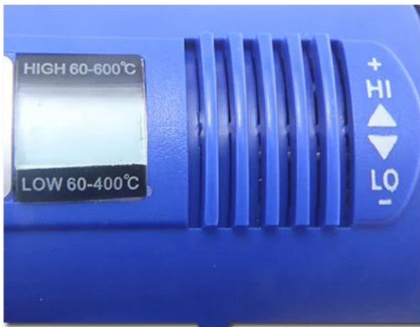
Temperature display Motor cooling port