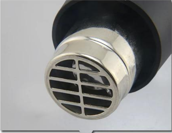
Hot air exit Can be attached to the nozzle