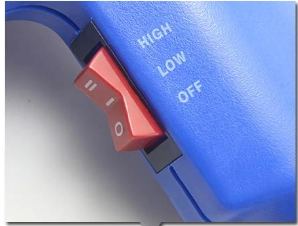
Two - stage thermostat switch